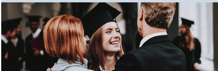
HUNT HEROES FOUNDATION IS ACCEPTING SCHOLARSHIP APPLICATIONS ALL MONTH LONG