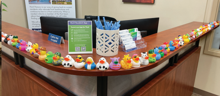
RUBBER DUCKY DAY