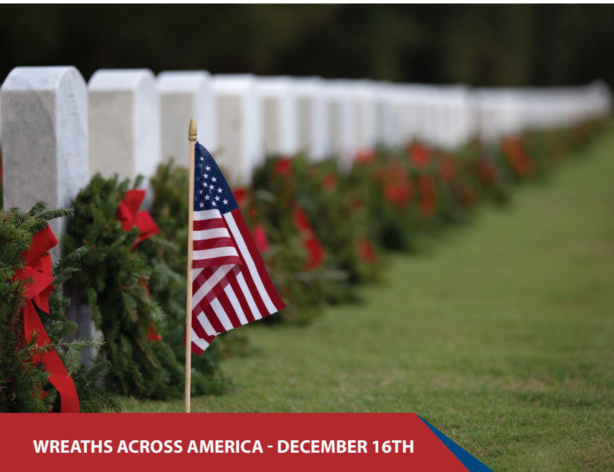
WREATHS ACROSS AMERICA - DECEMBER 16TH