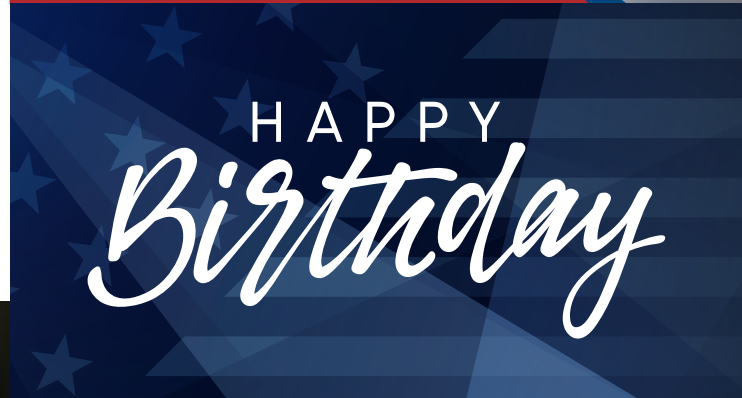
386TH BIRTHDAY OF THE U.S. NATIONAL GUARD - DECEMBER 13TH