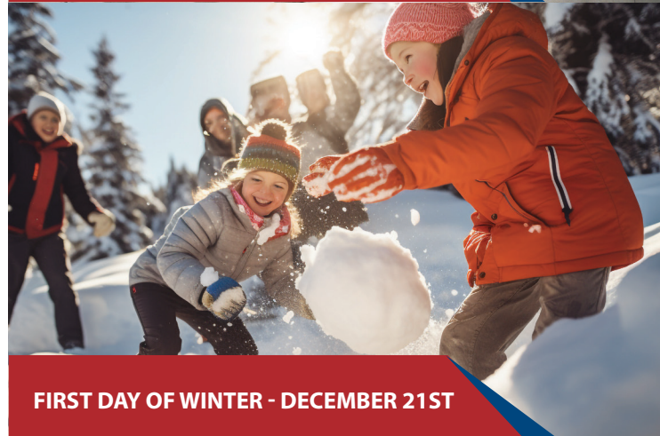
FIRST DAY OF WINTER - DECEMBER 21ST